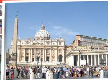
ROMA - San Pietro