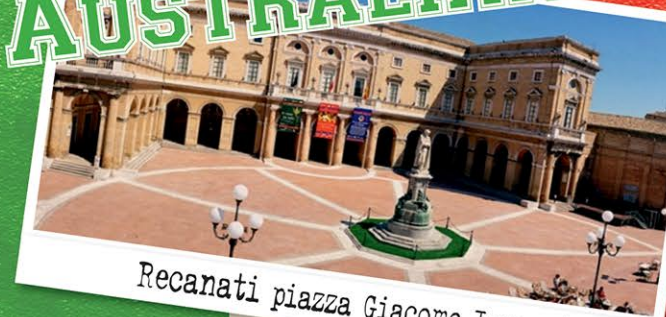
Recanati piazza Giacomo Leopardi

SPECIAL DISCOUNT OF 46% FOR ALL AUSTRALIANS