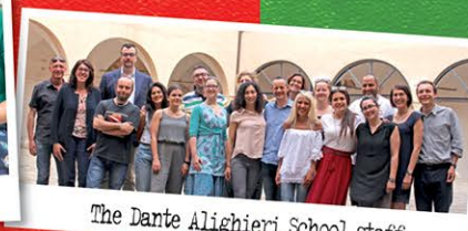
The Dante Alighieri School staff