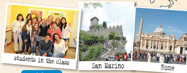
students in the class